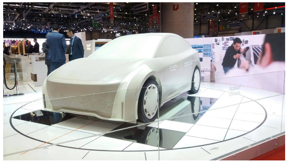
CRONUZ at the Geneva International Motor Show (GIMS) 2018.

As EVs go mainstream, achieving greater range will be a deciding factor for consumers. A recent Tesla study notes that a 10 percent improvement in aerodynamic performance gives a 5-to-8 percent increase in range for EVs. Aerodynamic performance becomes even more critical for highway driving. At speeds over 130 kilometers (km)/